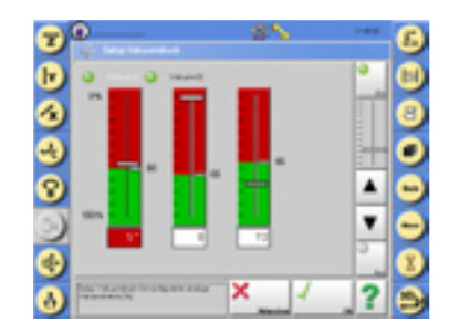
Analog Vacuum Circles